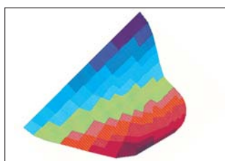
Diffusion of stress in the seal