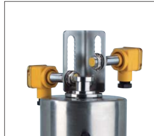
Proximity switch holder with two proximity switches

The valves can be equipped with the well-established Tuchenhausen control and feedback systems.