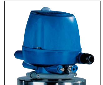
T.VIS® control system