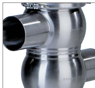
Welded seat ring

- Optional: welded seat ring available without surcharge